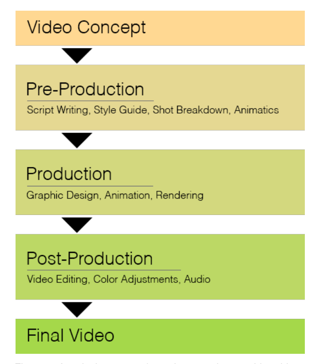
Figure 2: A typical process of creating a motion graphics video and the iteration between steps (e.g., style frame, moodboards, etc.). Casual motion designers were often unaware of the significance of these steps and skipped most aspects of pre-production; in contrast, professional motion designers spent most of their time in this stage.

Video production can typically be described as a process with three stages of pre-production, production, and post-production [49]. We use these phases as a lens to analyze the process of creating a motion graphics video and highlight a range of practices and challenges that participants faced across different stages. Each phase of the production process includes multiple steps that add to the complexity of the process for non-experts (Figure 2). Furthermore, despite the seemingly sequential nature of the process, motion designers often had to work on several steps at the same time and equip themselves with the know-how of adequately allocating time to each stage or reducing the length of others.